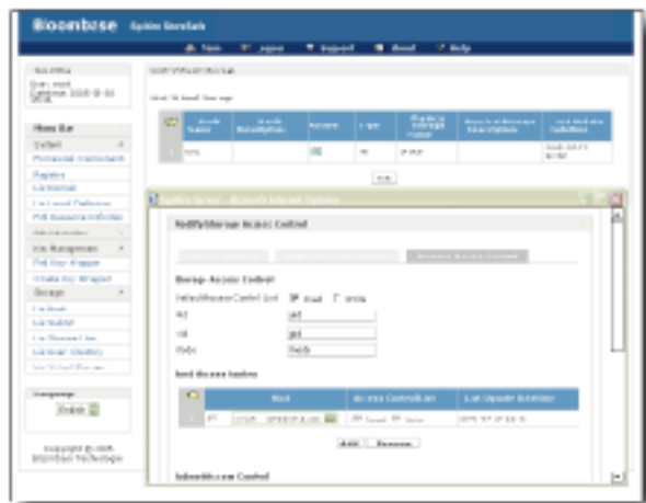
Spitfire StoreSafe management console

The load creator is made to execute for 24 hours restless on both systems. The ensemble volume of data encrypted and written to the encrypted volumes are recorded. System resources are closely monitored during the rally to ensure they run at abundant amount of resources. Spitfire StoreSafe SNMP alerts are also monitored to observe if runtime exceptions are produced during the rally.